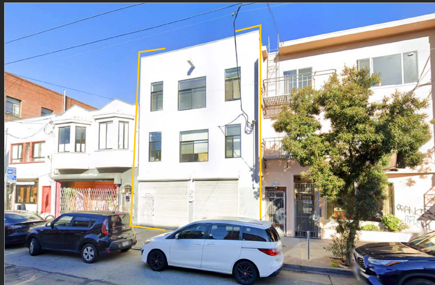
3370 18TH STREET / $2,750,000 3-LEVEL FLEX SPACE WITH PARKING SANTINO DEROSE / JACOB BROWN