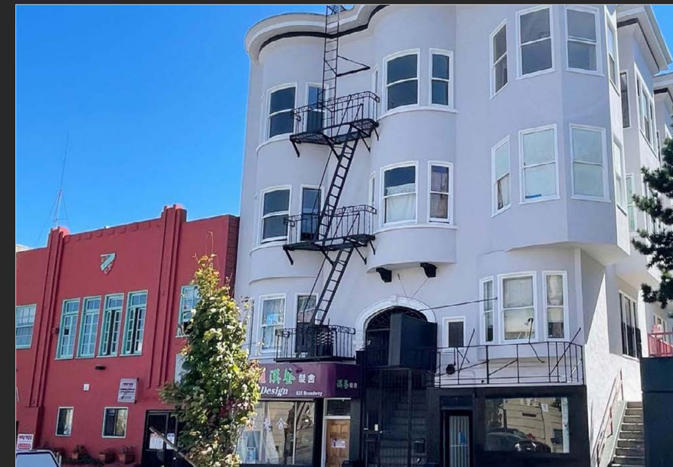
835 BROADWAY / $2,350,000 8-UNITS MIXED-USE BUILDING MATTHEW C. SHERIDAN / MARK FRY