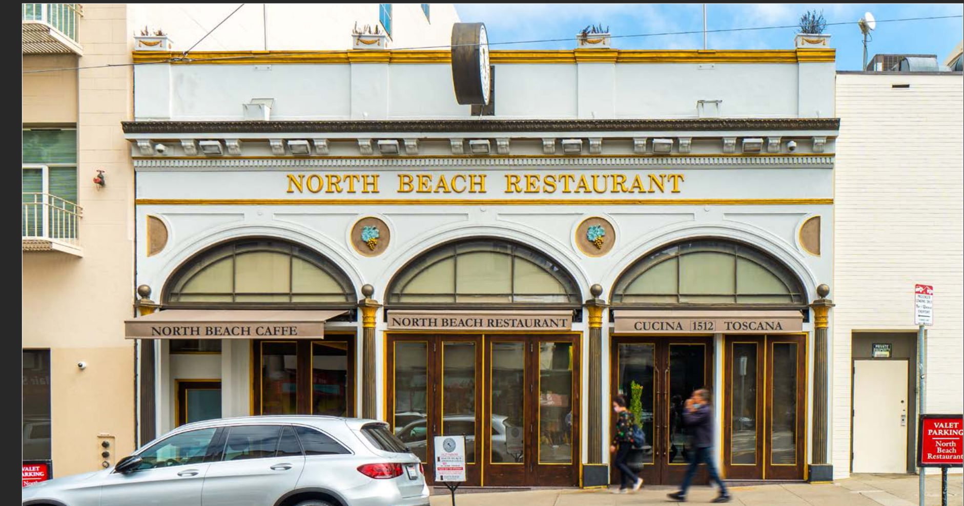
1512 STOCKTON / $4,495,000.00 NORTH BEACH RESTAURANT BUILDING CATHERINE MEUNIER / SANTINO DEROSE