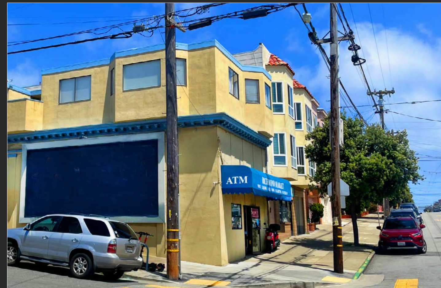
3950 BALBOA / $1,700,000 2 UNITS/OUTER RICHMOND JACOB BROWN / DOMINIC MORBIDELLI / MARK FRY