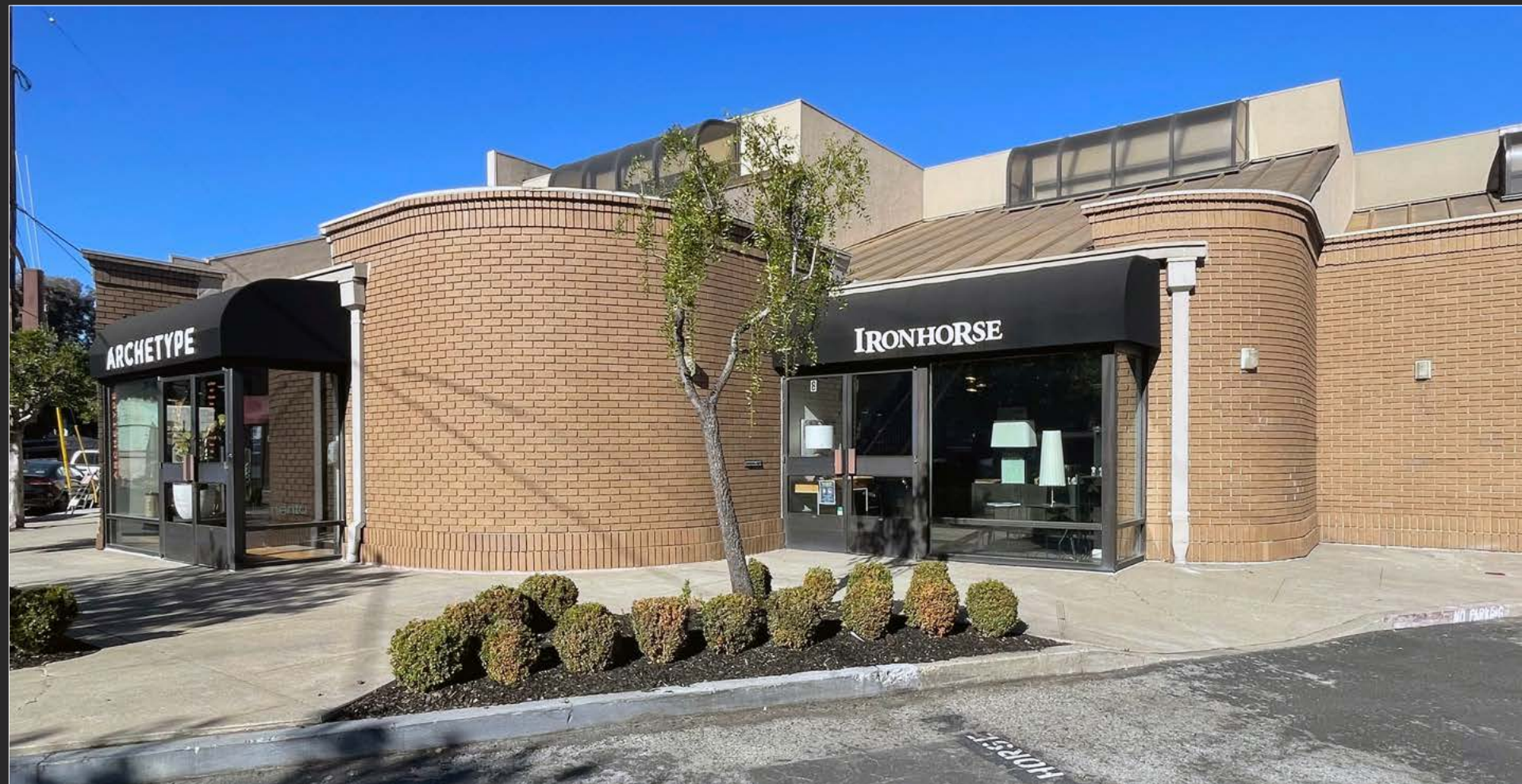
151 VERMONT / $1,895,000 COMMERCIAL CONDO / DESIGN DISTRICT SELLER FINANCING AVAILABLE SANTINO DEROSE / DOMINIC MORBIDELLI