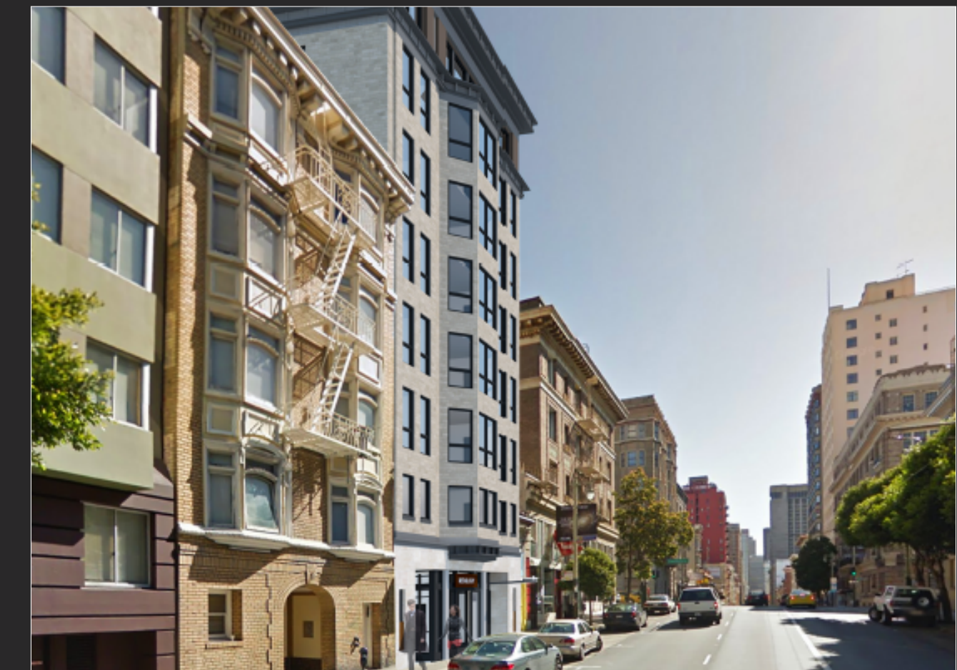
820 POST STREET / $2,050,000 NOB HILL / DEVELOPMENT OPPORTUNITY DOMINIC MORBIDELLI / MATTHEW C. SHERIDAN