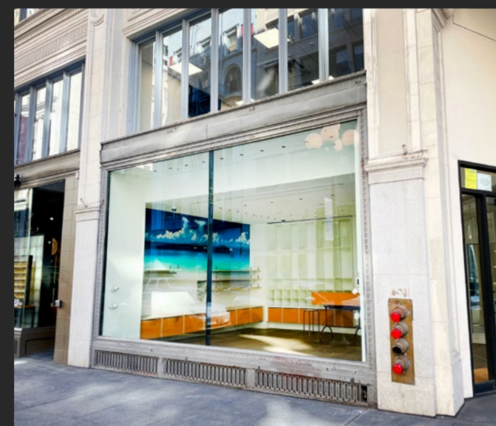
75 GEARY | UNION SQUARE | SF +/- 792 SF