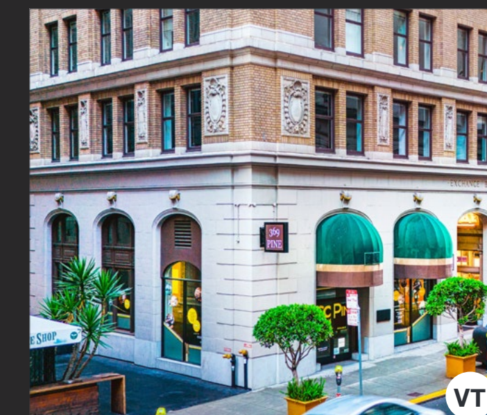
369 PINE | FIDI | SF 4,473 SF