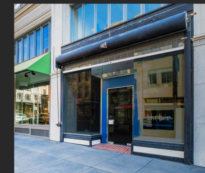
60 GRANT | UNION SQUARE | SF +/- 800 SF