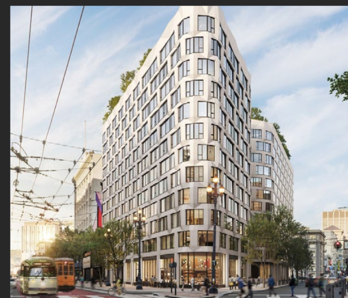
950 MARKET | MID MARKET | SF 6,000 SF Ground