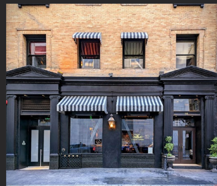
558 SACRAMENTO | FIDI | SF +/- 12,228 SF OVER 5 LEVELS