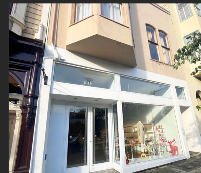
1919 FILLMORE | PACIFIC HEIGHTS | SF +/- 1,750 SF