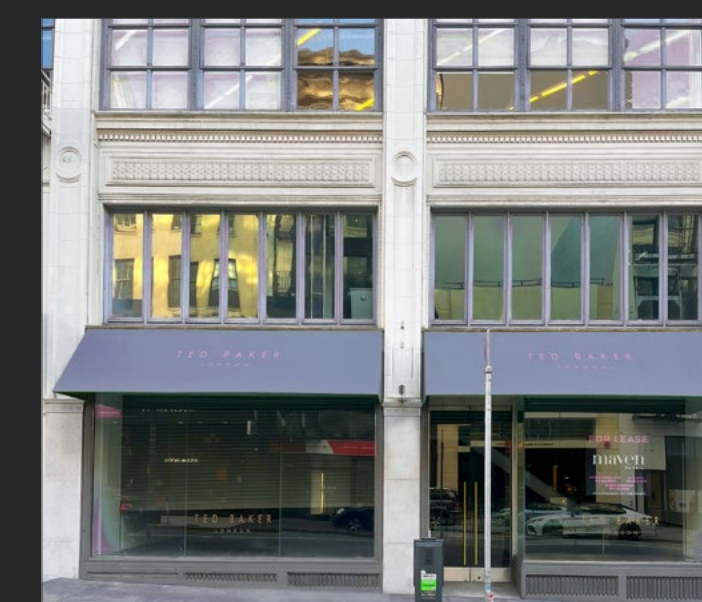
80 GRANT | UNION SQUARE | SF +/- 4,000 SF