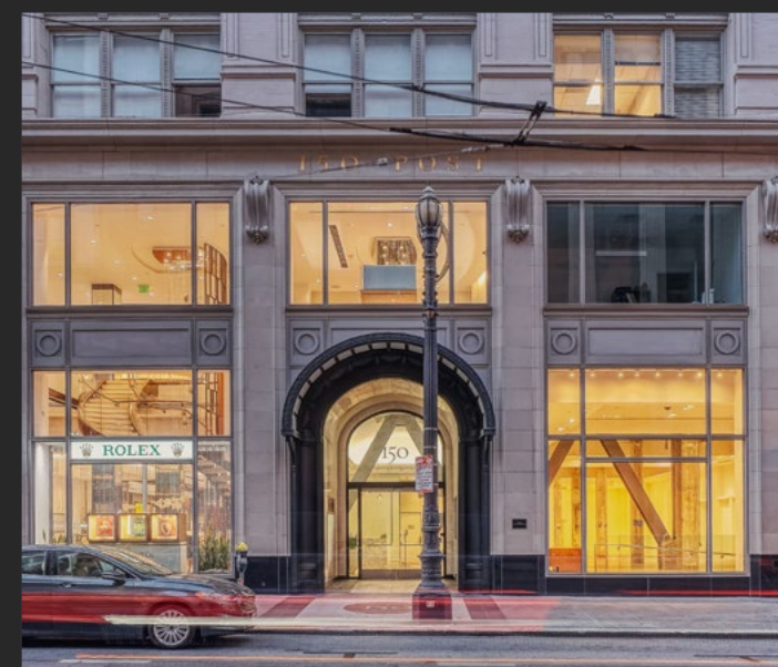
150 POST | UNION SQUARE | SF 6,444 SF Ground