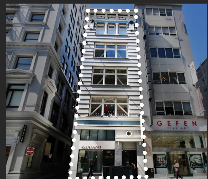
231 GRANT | UNION SQUARE | SF Square Footage to be Confirmed