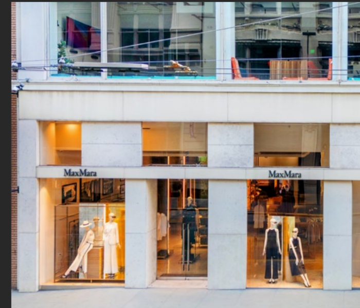
175 POST | UNION SQUARE | SF 5,500 SF Ground & 1,200 SF Basement