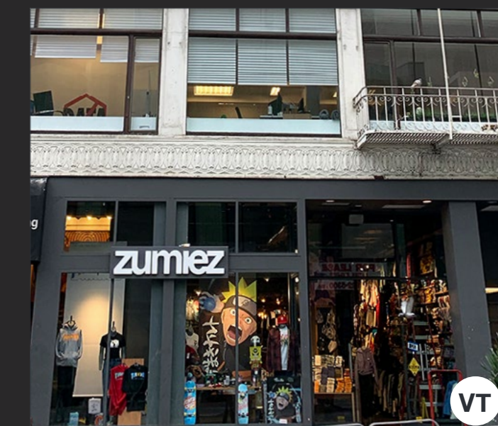
217 POWELL | UNION SQUARE | SF 2,500 - 5,000 SF