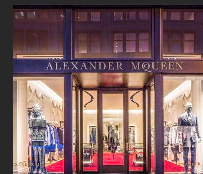
58 GEARY | UNION SQUARE | SF +/- 3,549 SF on ground + 1,594 SF lower level