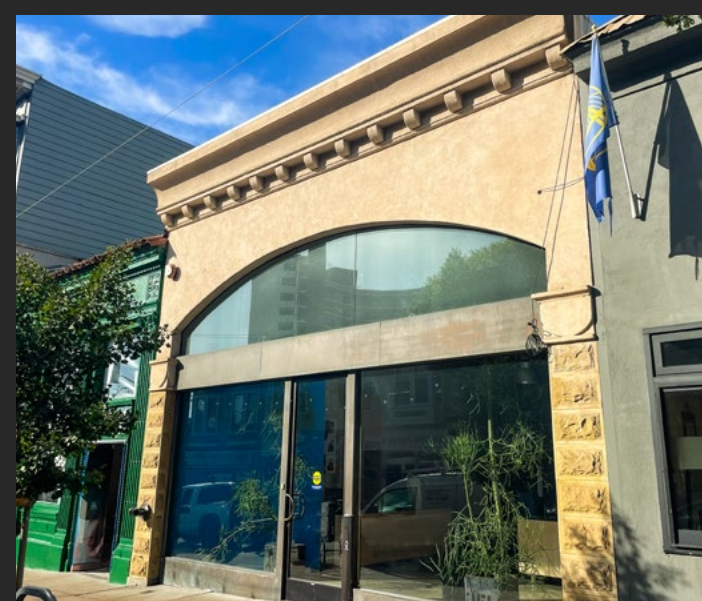
2225 FILLMORE | PACIFIC HEIGHTS | SF +/- 2,000 SF + 400 SF Mezzanine