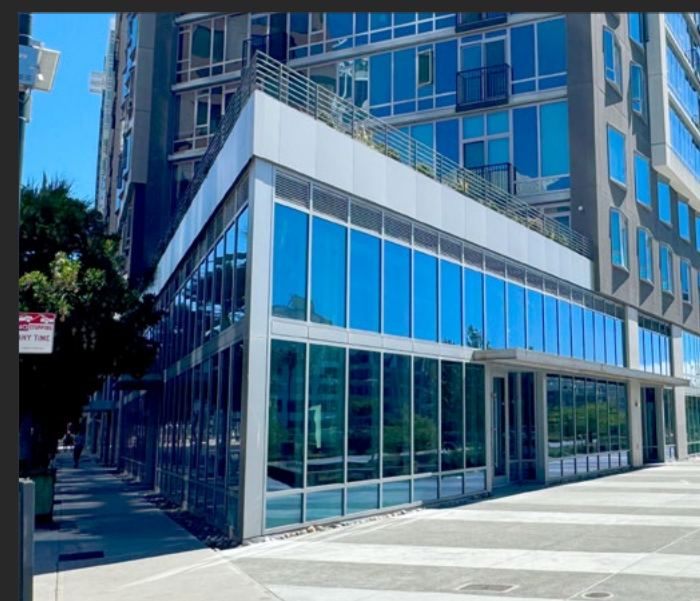
ONE MISSION BAY | DOGPATCH | SF 6,471 SF