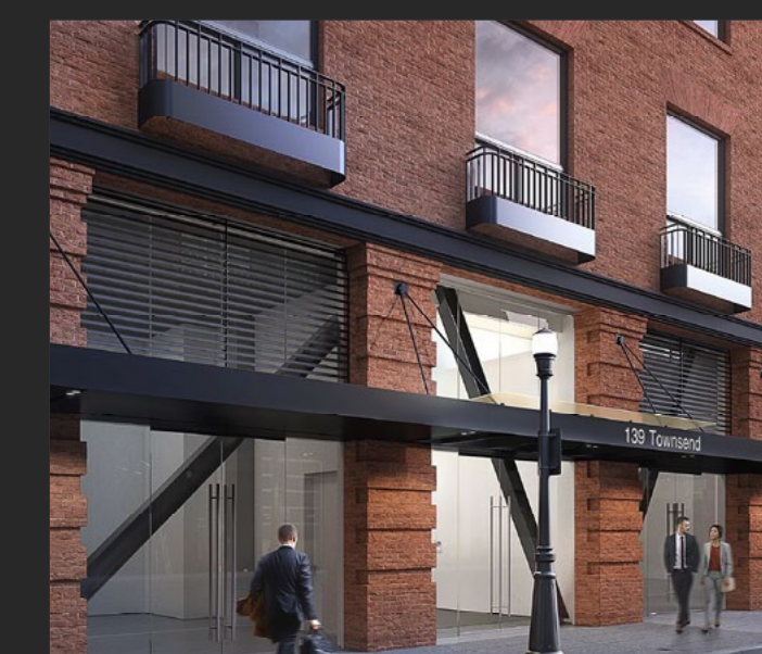
139 TOWNSEND | SOUTH BEACH | SF 6,201 SF