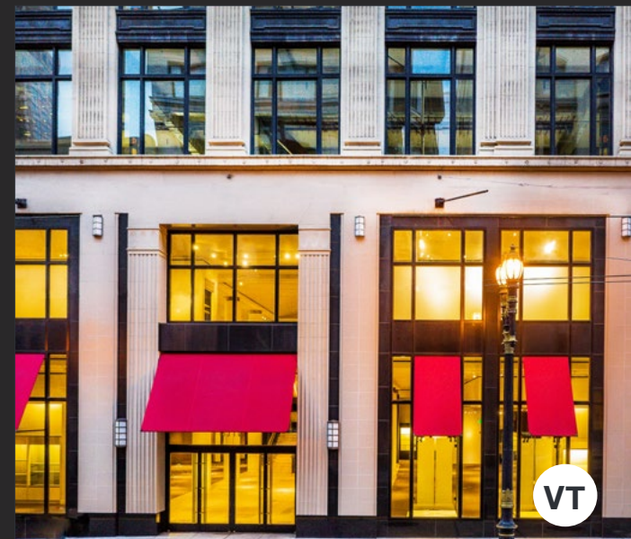
135 POST | UNION SQUARE | SF 10,000 SF Ground + 12,000 SF Second Level

GLORIA NORDBAKK office 415.225.0626 gloria@mavenproperties.com DRE #02207407