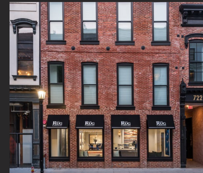
722 MONTGOMERY | FIDI | SF 1,663 SF Ground + 1,704 SF Basement (optional)