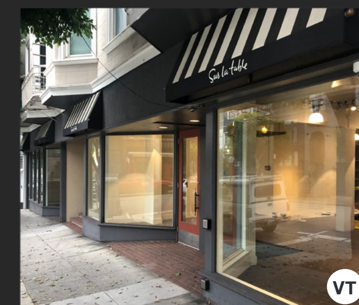
2224 UNION | COW HOLLOW | SF 3,000 SF - 7,040 SF