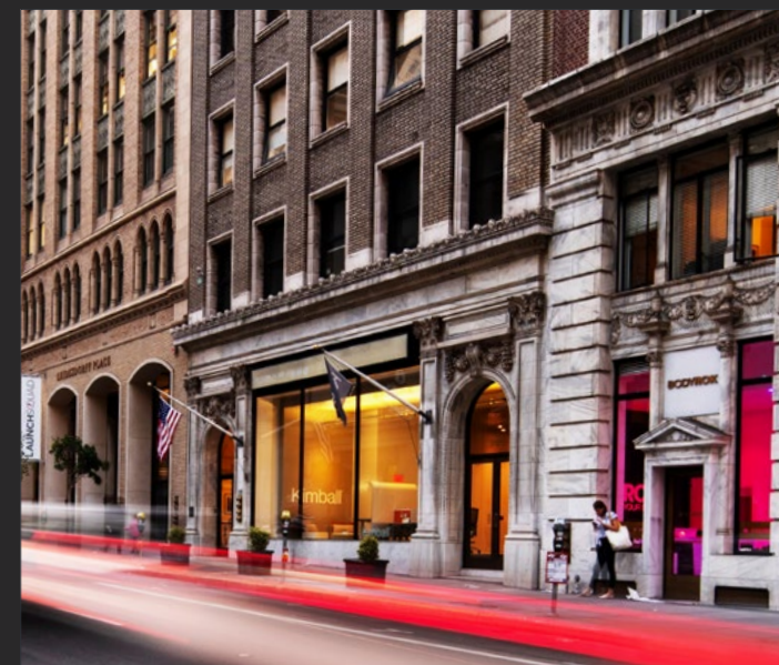
332 PINE | FIDI | SF 5,370 SF