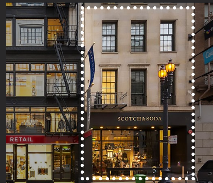
59 GRANT | UNION SQUARE | SF +/- 1,625 SF