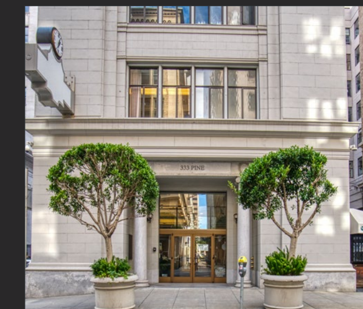
333 PINE | FIDI | SF 4,988 SF