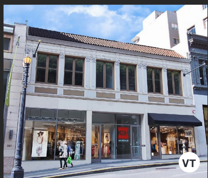
345-343 SUTTER | UNION SQUARE | SF 1,321 SF & 2,700 SF