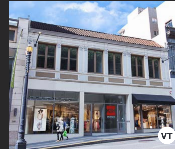
345-343 SUTTER | UNION SQUARE | SF 1,321 SF & 2,700 SF