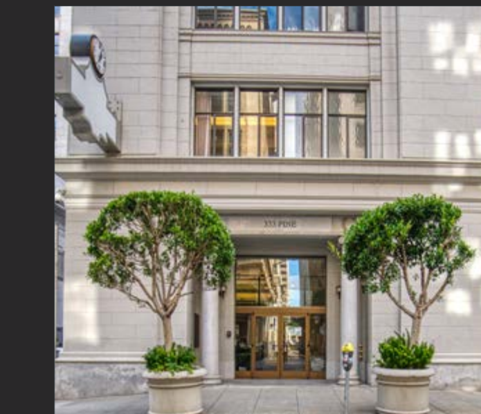
333 PINE | FIDI | SF 4,988 SF