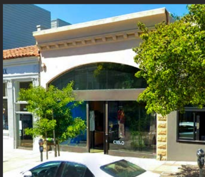
2225 FILLMORE | PACIFIC HEIGHTS | SF +/- 2,000 SF + 400 SF Mezzanine