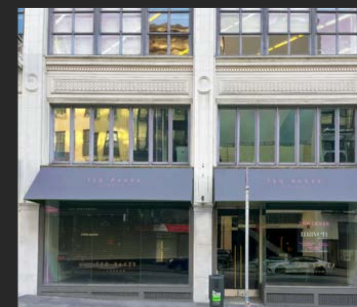
80 GRANT | UNION SQUARE | SF +/- 4,000 SF