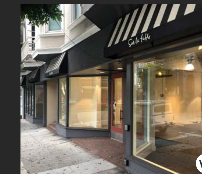
2224 UNION | COW HOLLOW | SF 3,000 SF - 7,040 SF