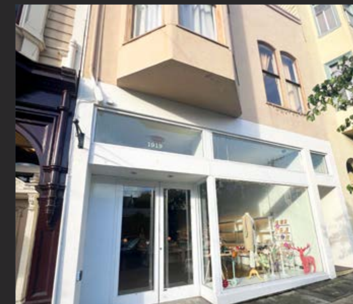
1919 FILLMORE | PACIFIC HEIGHTS | SF +/- 1,750 SF