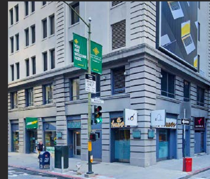
200 PINE | UNION SQUARE | SF 1,184 SF & 721 SF