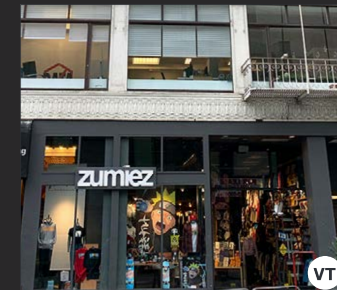
217 POWELL | UNION SQUARE | SF 2,500 - 5,000 SF