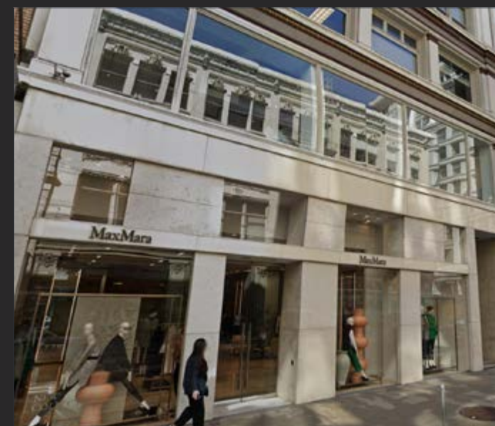
175 POST | UNION SQUARE | SF TBD