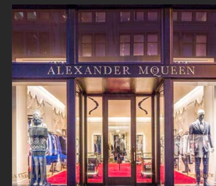
58 GEARY | UNION SQUARE | SF +/- 3,549 SF on ground + 1,594 SF lower level