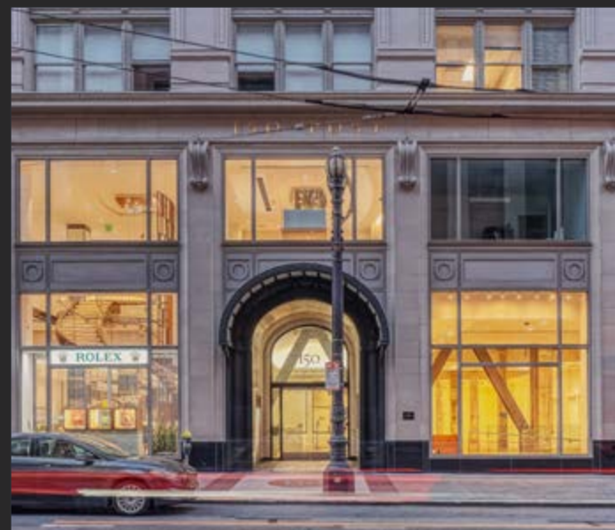
150 POST | UNION SQUARE | SF 6,444 SF Ground