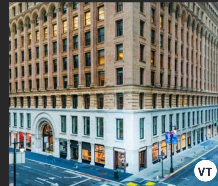
220 MONTGOMERY | FIDI | SF 4,117 SF