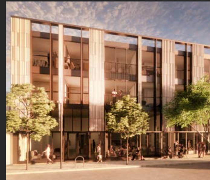
2055 CHESTNUT | PACIFIC HEIGHTS | SF 31,248 SF Ground