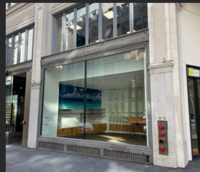
75 GEARY | UNION SQUARE | SF +/- 792 SF