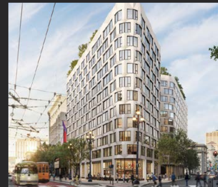
950 MARKET | MID MARKET | SF 6,000 SF Ground