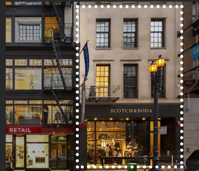
59 GRANT | UNION SQUARE | SF +/- 1,625 SF