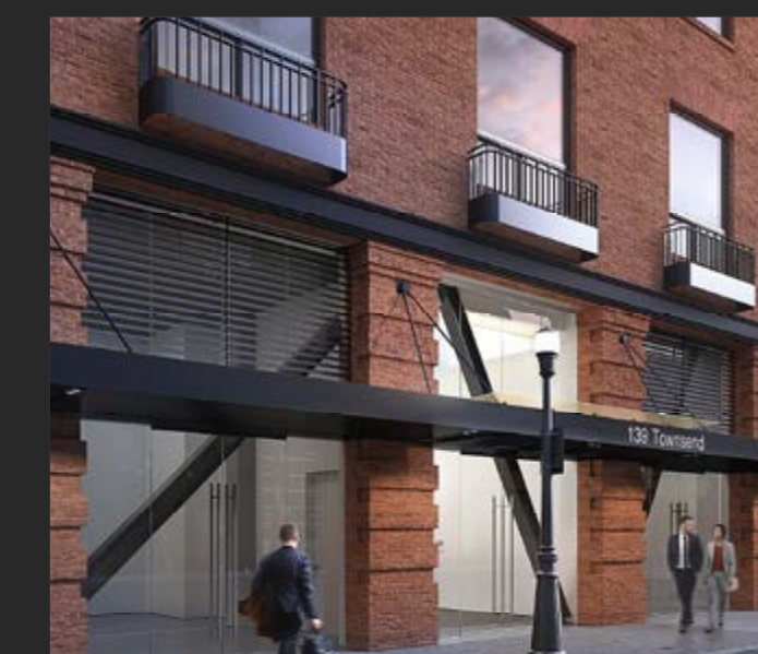
139 TOWNSEND | SOUTH BEACH | SF 6,201 SF