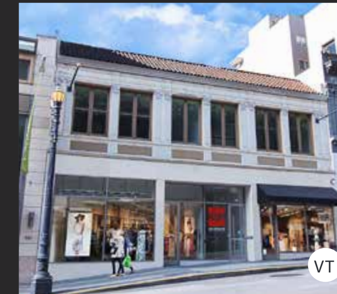
345-343 SUTTER | UNION SQUARE | SF 1,321 SF & 2,700 SF