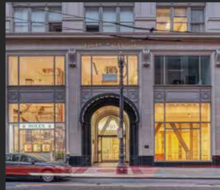
150 POST | UNION SQUARE | SF 6,444 SF Ground