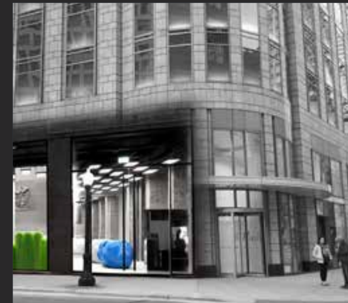
871 N. RUSH | CHICAGO 5,160 SF