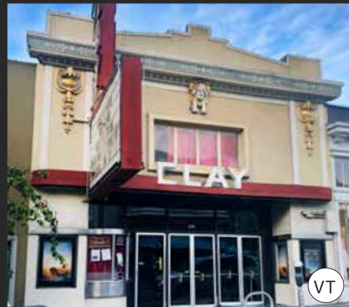
2261 FILLMORE | PACIFIC HEIGHTS | SF 4,662 SF Basement + 1,013 SF Mezzanine