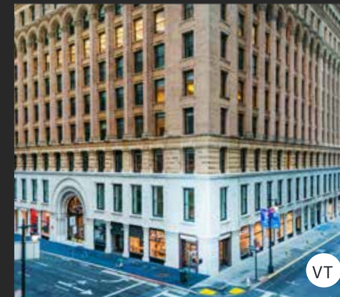
220 MONTGOMERY | FIDI | SF 3,544 SF & 4,117 SF