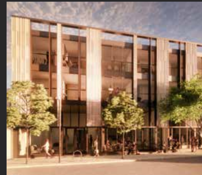
2055 CHESTNUT | PACIFIC HEIGHTS | SF 31,248 SF Ground