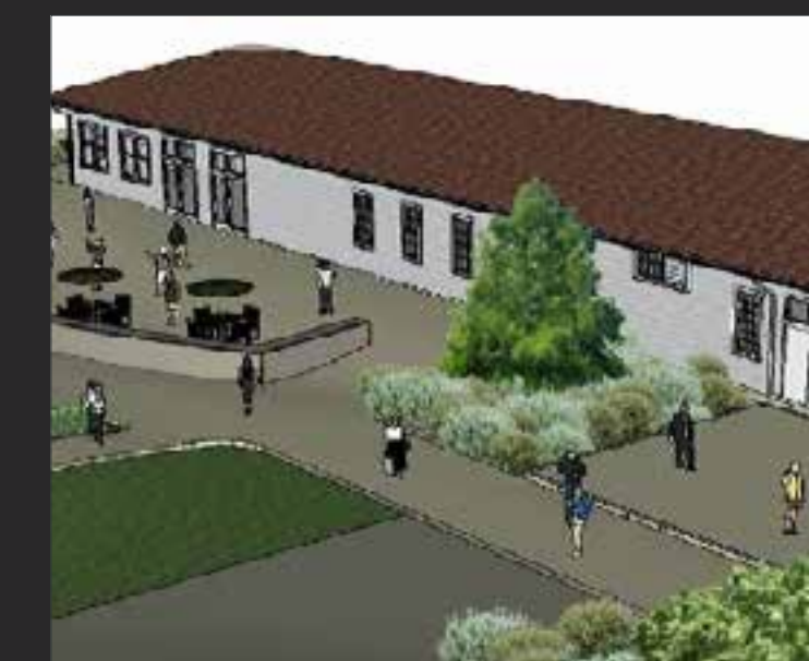
201 HALLECK | PRESIDIO | SF 6,200 SF + 2,700 SF Outdoor Patio