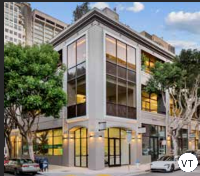
501 JACKSON | FIDI | SF 1,040 SF - 1,740 SF