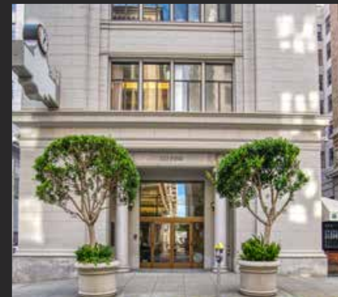
333 PINE | FIDI | SF 4,988 SF