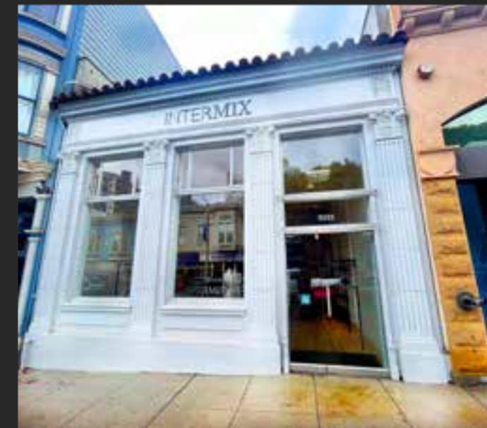
2223 FILLMORE | PACIFIC HEIGHTS | SF 1,600 SF Ground Floor + 600 SF Mezzanine