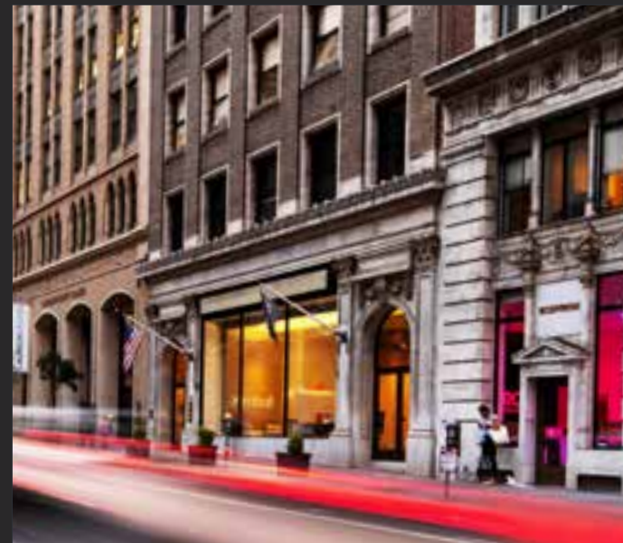
332 PINE | FIDI | SF 5,370 SF