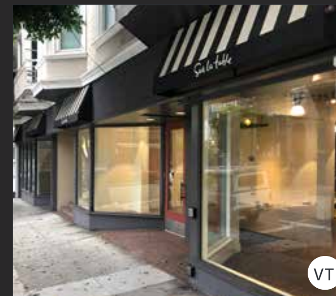
2224 UNION | COW HOLLOW | SF 3,000 SF - 7,040 SF