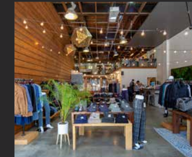
780 VALENCIA | MISSION | SF 4,987 SF + 1,349 SF Mezzanine