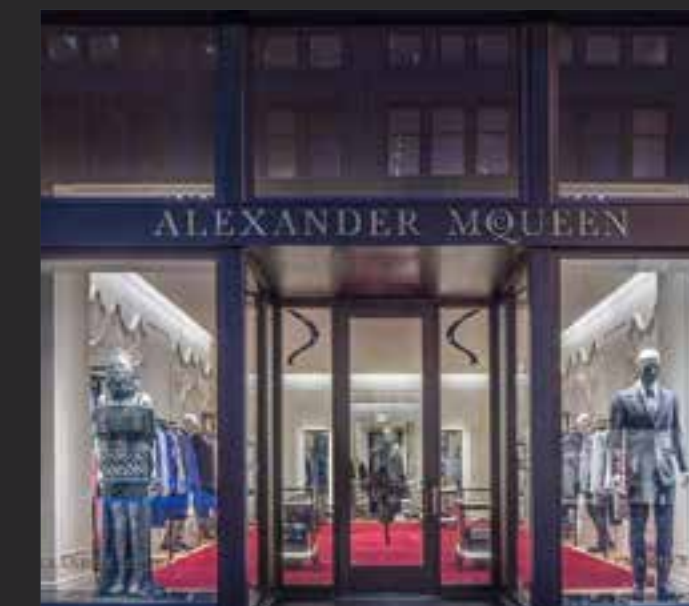
58 GEARY | UNION SQUARE | SF +/- 3,549 SF on ground + 1,594 SF lower level