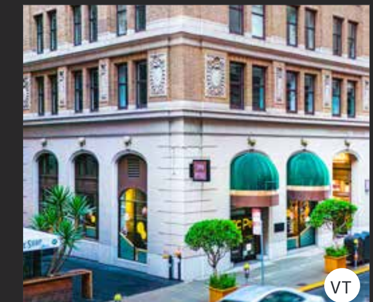
369 PINE | FIDI | SF 4,473 SF