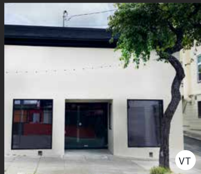
1928 FILLMORE | PACIFIC HEIGHTS | SF 2,275 SF + 1,000 SF Basement