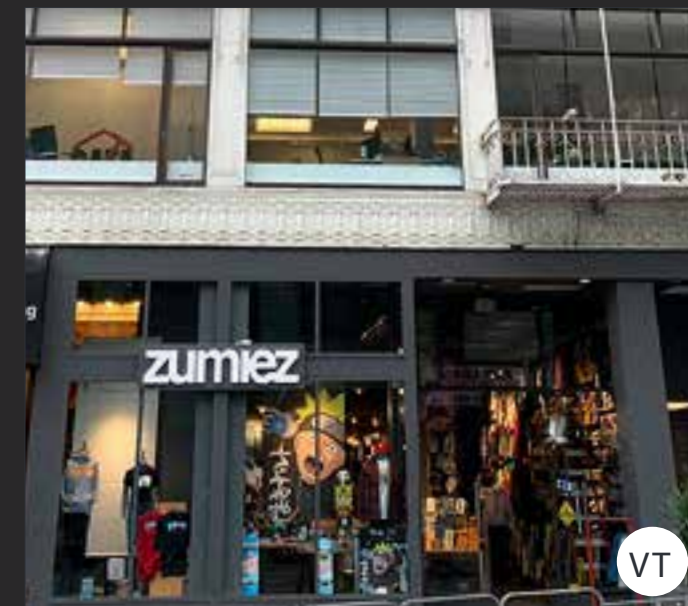
217 POWELL | UNION SQUARE | SF 2,500 - 5,000 SF