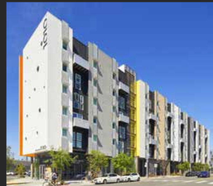
1010 16TH | POTRERO | SF 2,855 SF