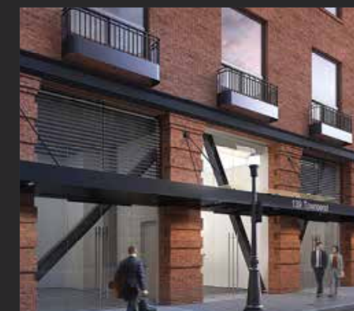
139 TOWNSEND | SOUTH BEACH | SF 6,201 SF