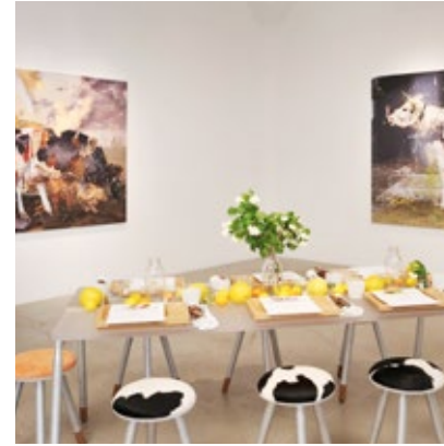
CATHARINE CLARK GALLERY