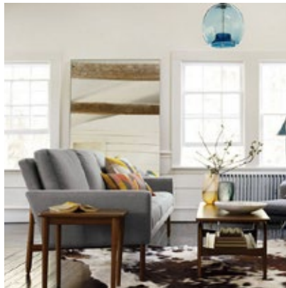
DESIGN WITHIN REACH