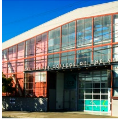
CALI. COLLEGE OF THE ARTS

Once a to-the-trade-only destination, San Francisco's expanding Design District boasts plenty of premier showrooms that cater to the public. The heart of the district is Townsend and Henry Adams streets and the Design Center, but there are shops dotted among blocks within the borders and just beyond. There is an influx of new residential housing and tech businesses over the past year that has livened up this South of Market neighborhood. 151 Vermont is located in the heart of it all.