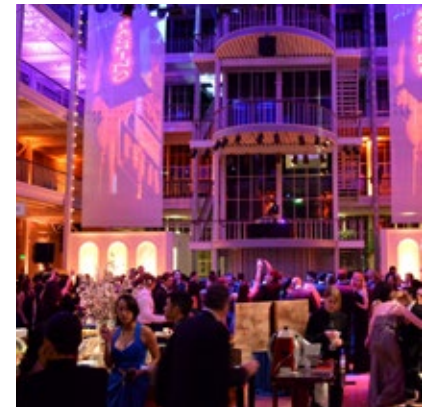
SF DESIGN CENTER