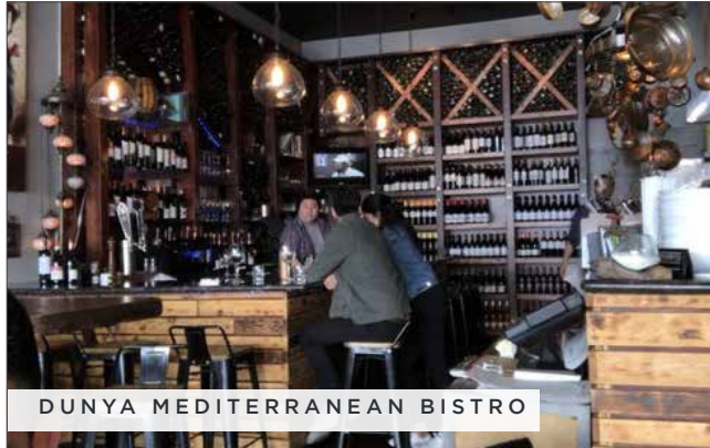
DUNYA MEDITERRANEAN BISTRO