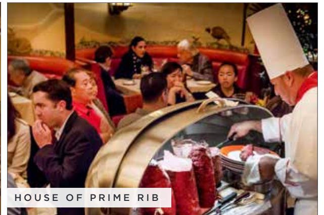
HOUSE OF PRIME RIB