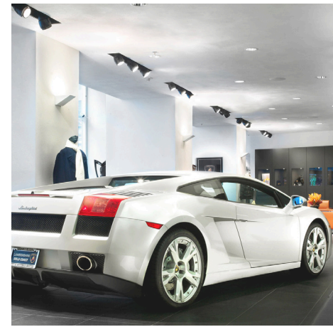
LAMBORGHINI GOLD COAST