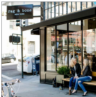
RAG & BONE

1946 Fillmore is located in the Pacific Heights neighborhood. Dining, entertainment, and shopping options in Pacific Heights mirror its diverse surroundings. Japantown is a major draw to the neighborhood, with Fillmore and Divisadero streets serve up numerous shopping, eating, and drinking opportunities. It is filled with delicious restaurants from high-end to casual, as well as lively karaoke bars and the Kabuki Theater. Musical and cultural history flow through next door neighborhood Fillmore Street.