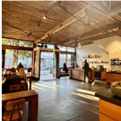
FOUR BARRELL COFFEE