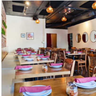
LITTLE STAR PIZZA